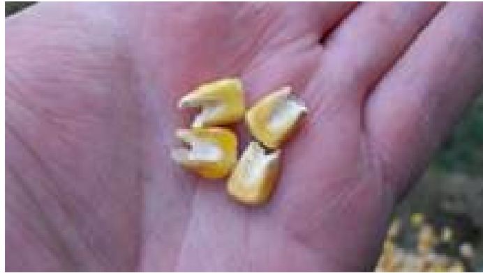
Grey Squirrels will only eat the kernel and is a good activity monitor as well as bait.

Many types of bait have been compared, including wheat, rice, peanuts, peanut butter, acorns and hazelnuts but yellow whole maize has proved to be the best all round bait.